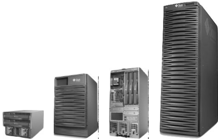
Figure3-1 The Sun Fire 3800-6800 server line is a family of large-scale, shared memory, symmetric multiprocessor systems based on the SPARC processor architecture.

There are four members of the Sun Fire 3800-6800 server product line, including a new eight-processor entry-level departmental server, a mid-sized 12-processor departmental server system, a version of the 12-processor server designed for Internet data centers, and a large 24-processor server for data center tasks such as database, data mining, or server consolidation applications. Additional features are summarized in table 3-1.