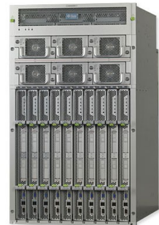
Figure 1: Sun Blade 8000 Modular System HDDs, and six PCI Express interfaces. This combination can pump out 1.92 Tbps of I/O throughput in a single 19U chassis, besting the throughput and density of traditional blade servers. The flexible architecture of the Sun Blade 8000 Modular System is based entirely on externally accessible hot-pluggable components—I/O, processing, system management, and chassis infrastructure. All

The Sun Blade 8000 chassis accommodates up to ten 4-socket AMD Opteron-based server modules, each supporting up to 64 GB of memory, two hot-swappable SAS or SATA