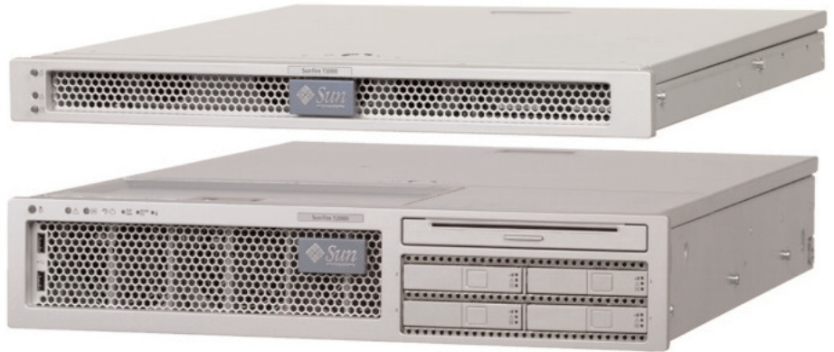
Figure 2: Sun Fire T1000 and T2000 servers provide dramatic scalability for most Web-tier applications.