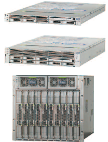
Figure 2. Sun SPARC Enterprise T5120 and T5220 servers and Sun Blade T6320 server modules provide built-in cryptography acceleration and other security features to enable the deployment of fast, secure Web infrastructures.

Based on the same UltraSPARC T2 processor and designed to fit in the Sun Blade 6000 Modular System, the Sun Blade T6320 server module provides high performance and outstanding density in a compact form factor. Up to 142 Gigabit per second of throughput is delivered through 32 lanes of PCI Express I/O, as well as multiple gigabit Ethernet and SAS links. As a compute node in massively horizontally scaled environments, the Sun Blade T6320 server module can help provide a substantial building block for Web infrastructures.