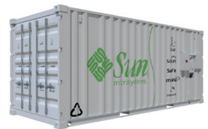
Figure 2. A Sun™ Modular Datacenter is a pod design deployed within its own container.

Sun offers a range of datacenter consulting services that help you through the process of developing a datacenter strategy, designing the datacenters themselves, and building them (Figure 3).